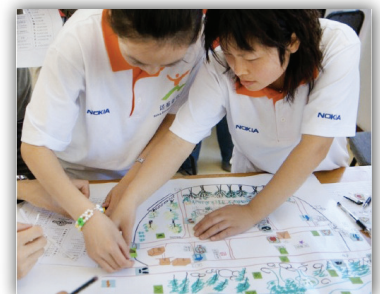
Nokia's Green Map workshop