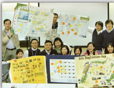
Workshop engaged staff leadership skills