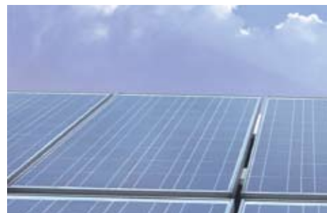
Solar PV system generates clean energy

By highlighting these green living resources and the company's commitment to environmental protection, the maps encourage employee and public participation in sustainability. The most impressive data is the amount of CO 2 emissions reduced as part of the process which can be found at the top of every Green Map. This is an achievement that can be appreciated by all.