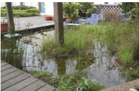
Pond habitat for indigenous wildlife

a best practices exchange and the company's Green Mapmakers from Taiwan, China, Japan, Thailand, US, and Netherlands gathered together to share their experiences and to tour extensive working and living facilities at our Wujiang, China plant. Delta's Green Maps chart areas ranging from a single floor of an office building to a 20,000-employee campus with a dozen buildings. Important environmental sites, such as an electric power recycling system, the plant's greenery, employee living areas and recycling achievements were presented on the maps.