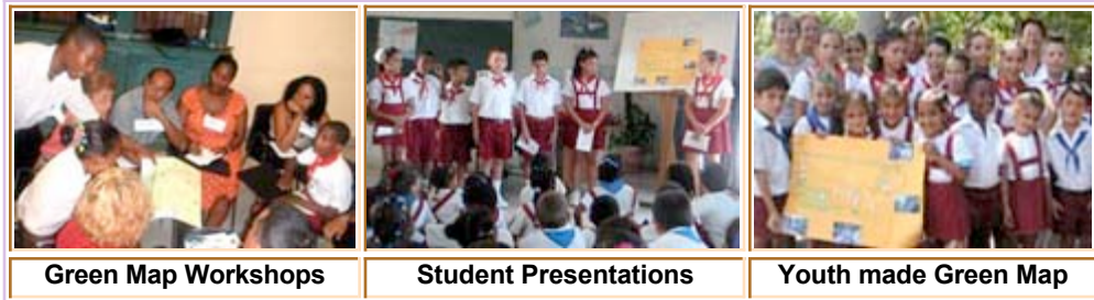
Green Map Workshops

The Mapa Verde Cuba network gives structure to the island's various participating teams and has helped create exchanges, document different experiences, and provide videos, manuals and training. Their primary function is to run Mapa Verde workshops, linking mapmakers, students, and community leaders from 26 municipalities in 11 participating provinces.