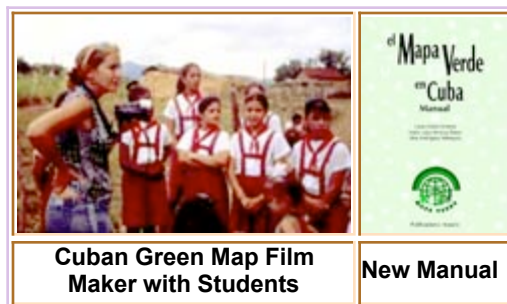
Cuban Green Map Film Maker with Students

Highlights community action with stories of mapping experiences & transformations.