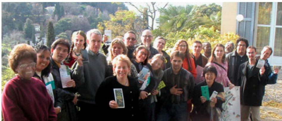
22 Green Mapmakers from Brazil, Canada, Cuba, Denmark, Indonesia, Ireland, India, Iceland, Japan, Romania, Sweden, the UK, the USA and Zimbabwe at GMS's first Global Meeting at Bellagio.

Critically important are the stories of how the Green Maps are being made, and what impacts they are having on the communities involved. At Bellagio, we discussed ways to increase public awareness and local participation, and then we applied these concepts to plan a series of well-illustrated regional and thematic Green Map Atlas volumes. Now, GMS and our Japan Hub have received funding through Japan-US Community Education and Exchange to produce the web