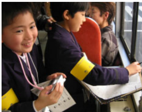
Charting the EcoPeace Map with Hiroshima's youth

EUROPE: Oxford and Manchester's Irk Valley UK, Rotterdam's Deelgemeente Prins Alexander district, The Netherlands and Milan Italy.