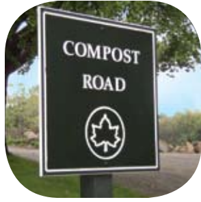
9. As seen in Central Park

The average NYC household discards two pounds of organic waste each day. Citywide, that's 1,000,000 tons a year! Composting turns this mountain of material into a renewable resource that helps green up NYC, indoors and out. Composting is the most energy efficient kind of recycling, and helps reduce the number of stinky garbage truck trips, too!