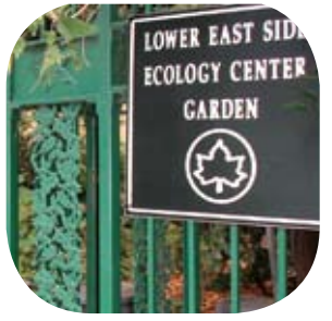
18. Drop compostables any time

Go further! Lower East Side Ecology Center offers free workshops: backyard composting, indoor vermicomposting, composting for the classroom, "leave it on the lawn" yard care and master composter certification courses. Free compost givebacks, too! Get details on making or using compost on the Rot Line: 212-477-3155 or email: info@leseecologycenter.org