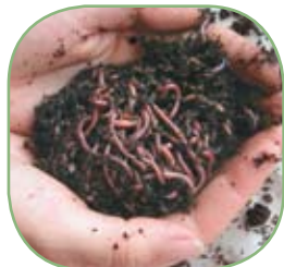
Red wiggler worms

Worm composting (vermicomposting) is an indoor method for recycling food waste into rich compost. In your apartment, basement, office or classroom, fill a container with moistened newspaper and red worms, then continually add food and plant waste. Excitingly, red wiggler worms eat half their weight in food each day and leave worm castings (a.k.a. compost) behind, so it's extremely effective, even for busy New Yorkers! Free workshops are held in every borough, year round – check out nyccompost.org for the schedule.