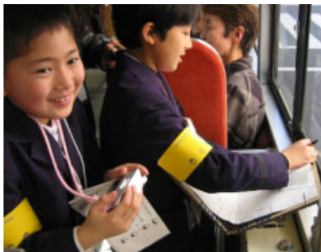
Charting the EcoPeace Map with Hiroshima's youth

EUROPE: Oxford and Manchester's Irk Valley UK, Rotterdam's Deelgemeente Prins Alexander district, The Netherlands and Milan Italy.