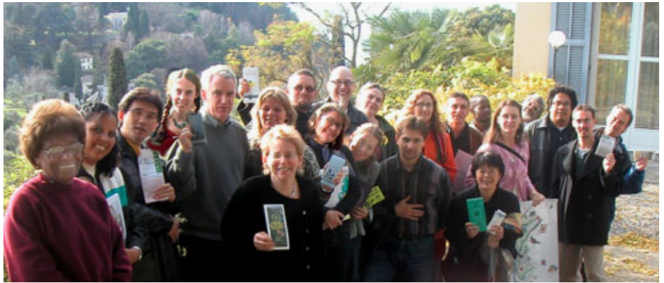
22 Green Mapmakers from Brazil, Canada, Cuba, Denmark, Indonesia, Ireland, India, Iceland, Japan, Romania, Sweden, the UK, the USA and Zimbabwe at GMS's first Global Meeting at Bellagio.

Critically important are the stories of how the Green Maps are being made, and what impacts they are having on the communities involved. At Bellagio, we discussed ways to increase public awareness and local participation, and then we applied these concepts to plan a series of well-illustrated regional and thematic Green Map Atlas volumes. Now, GMS and our Japan Hub have received funding through Japan-US Community Education and Exchange to produce the web