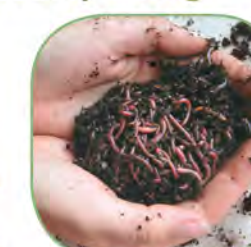
Red wiggler worms

Worm composting (vermicomposting) is an indoor method for recycling food waste into rich compost. In your apartment, basement, office or classroom, fill a container with moistened newspaper and red worms, then continually add food and plant waste. Excitingly, red wiggler worms eat half their weight in food each day and leave worm castings (a.k.a. compost) behind, so it's extremely effective, even for busy New Yorkers! Free workshops are held in every borough, year round - see schedule at NYCCompost.org