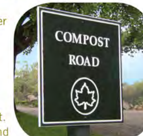
9. As seen in Central Park

The average NYC household discards two pounds of organic waste each day. Citywide, that's 1,000,000 tons a year! Composting turns this mountain of material into a renewable resource that helps green up NYC, indoors and out. Composting is the most energy efficient kind of recycling, and helps reduce the number of stinky garbage truck trips, too!