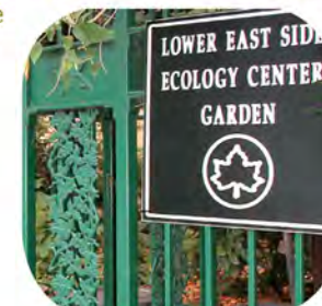
19. Drop compostables any time

Go further! Lower East Side Ecology Center offers free workshops: backyard composting, indoor vermicomposting, composting for the classroom, "leave it on the lawn" yard care and master composter certification courses. Get details on making or using compost on LESEC's Rot Line: 212-477-3155 or email: info@leseccologycenter.org