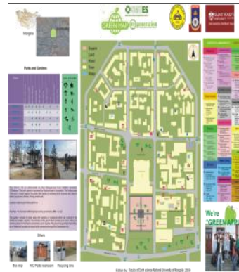
Green Map of Central Square in Ulaanbaatar