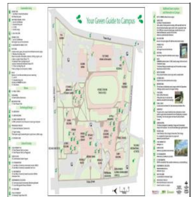
Saint Mary’s University Green Map