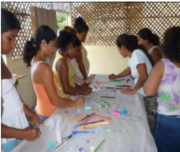
Local women in Ecuador work on a Green Map