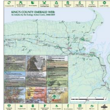
Kings County Emerald Web: An Initiative by Ecology Action Centre

To learn more about the Emerald Web Initiative or the EAC please visit their website or contact them by email at: info@ecologyaction.ca