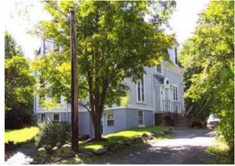
The Oaks Building, Saint Mary's

The International Activities Office offers students, faculty and the public information about student mobility, international projects and services, and linkages with universities and other organizations throughout the world. We are dedicated to enriching lives through the development and enhancement of international experiences and perspectives. Through our international network of contacts, we are able to provide support to anyone involved with the Saint Mary's community who is interested in becoming involved in a broad range of activities with an international focus.