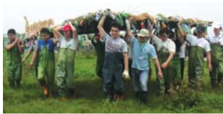
Creation of a floating island