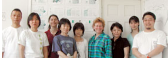
Chubu Recycle's Aichi Green Map coordinators with Green Map System staff at our NYC office in May 2004.